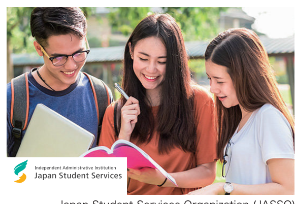
Japan Student Services Organization (JASSO)